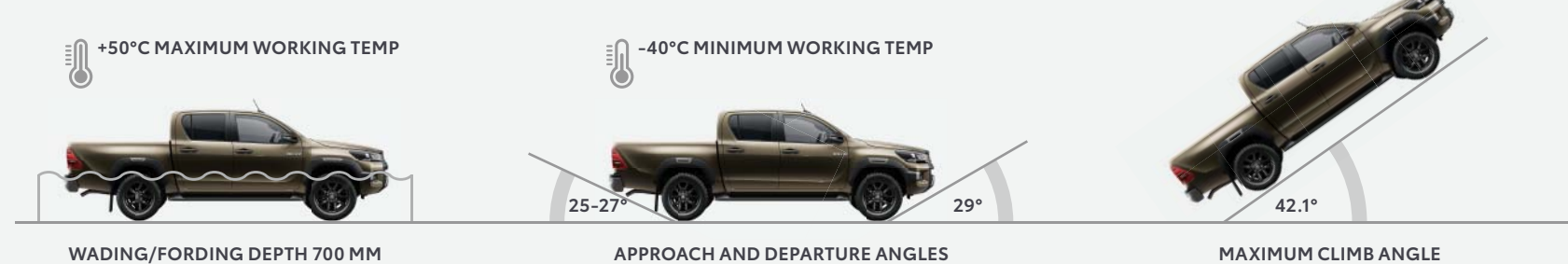
APPROACH AND DEPARTURE ANGLES